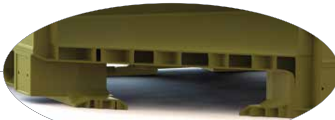
Cross section of our I-Beam welded technology which increases base strength by up to 40%

Repairable: If a break occurs, every piece of Monoflo's bulk containers is repairable in the field in a matter of minutes.