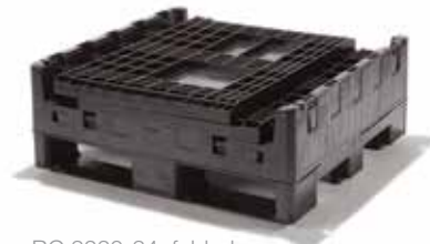
BC 3230-34, folded