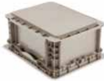
NRSO 1215-07, flat bottom (L), cross-stacking bottom (R)