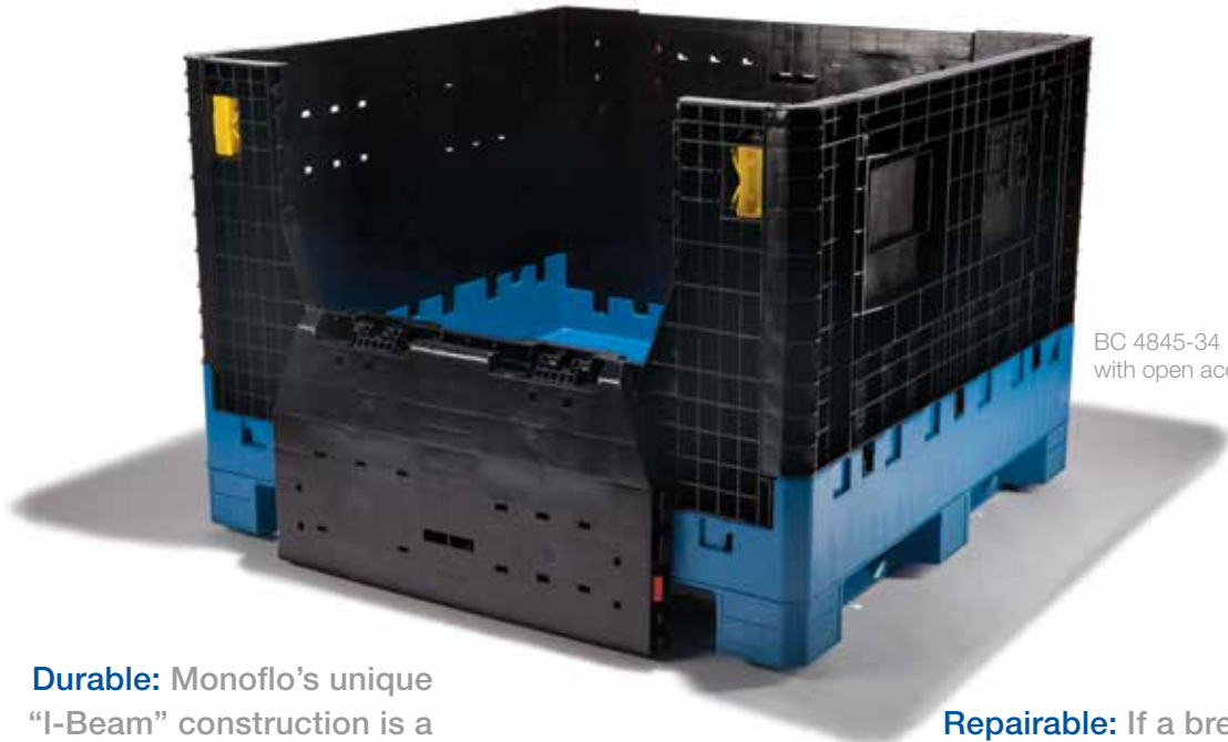
BC 4845-34 with open access door

Sustainable: Our bulk containers are 100% recyclable. Additionally, with no fiberglass or metal reinforcements, our bulk containers weigh less than others which means fewer raw materials are used.