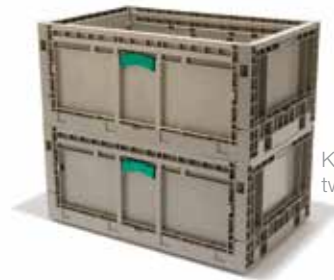
KD 2415-09 two stacked