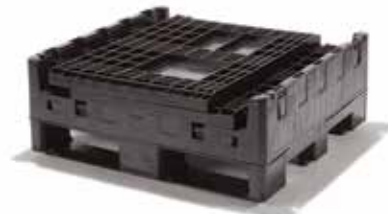
BC 3230-34, folded