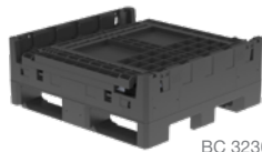
BC 3230-34, collapsed