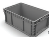
Straight Wall Containers