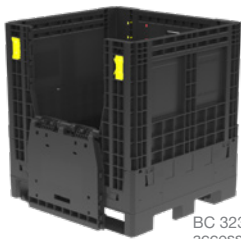
BC 3230-34, side wall access door open