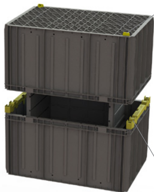
Interlocks are recyclable and can be returned with Spacers.

Step-by-Step How to Use the RPS The RPS is designed to be reused and your help is required to ensure complete return of components is executed thoroughly.