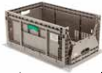
KD6040-285 with vented side walls and open access door