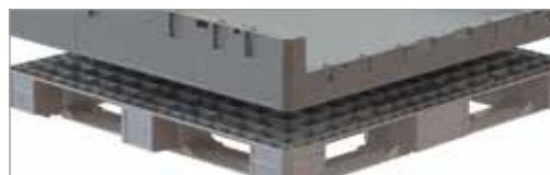
Cross section of our I-Beam welded technology which increases base strength up to 40%

Durable: Monoflo's unique "I-Beam" construction is a two-piece welded design that makes the strongest, most durable base in the industry.