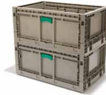
KD 2415-09 two stacked