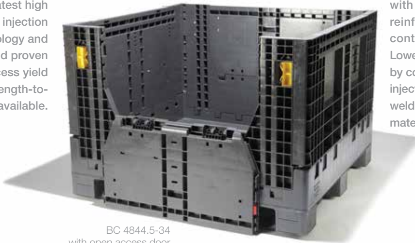
BC 4844.5-34 with open access door

Our unique combination of the latest high pressure injection molding technology and our tested and proven welding process yield the best strength-to-weight ratio available.