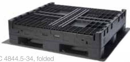
BC 4844.5-34, folded

New textured label areas eliminate the need for placards