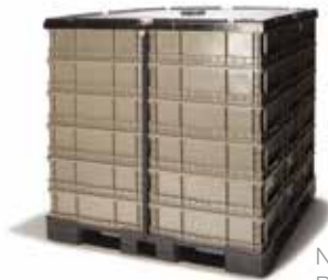
NSO 2415s on SP 4845-5-IMW-I Pallet with top cap TC 4845-3-IM-II including seat belts