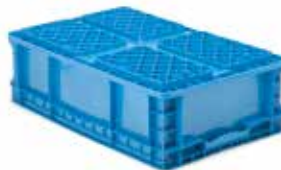
NSO 2415-07, flat bottom (L), cross-stacking bottom (R)